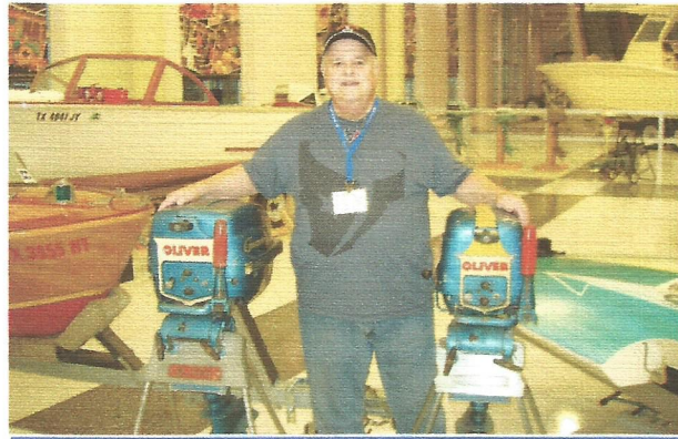
The majority of guests did not know that Oliver Tractor Corporation made an outboard motor. In fact, many visitors did not know what Oliver Tractor was at all.