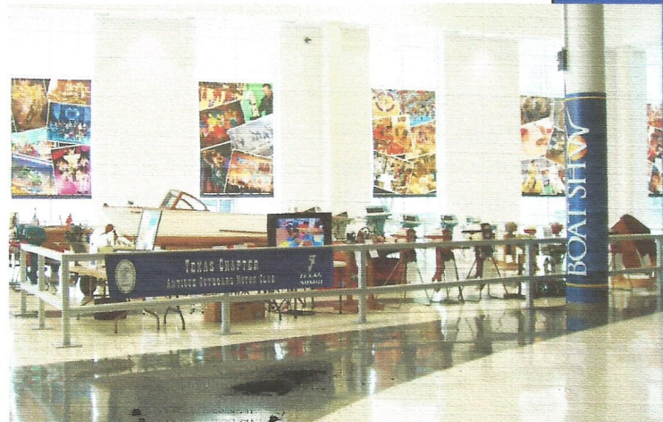
Our Texas Chapter banner attached on our second display area