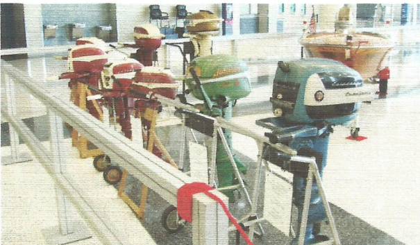
Mark Betner's display of vintage outboards